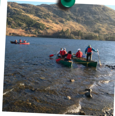
Lake District Residentials