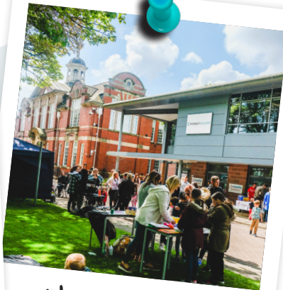
Worsley Fun Day