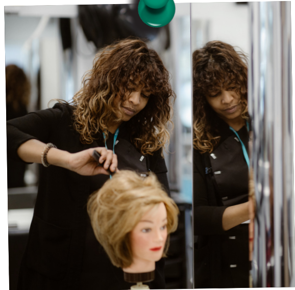
Worsley Hair Salon